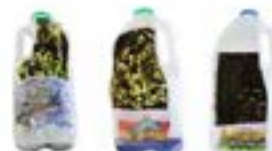
Recycled planters by Lottie