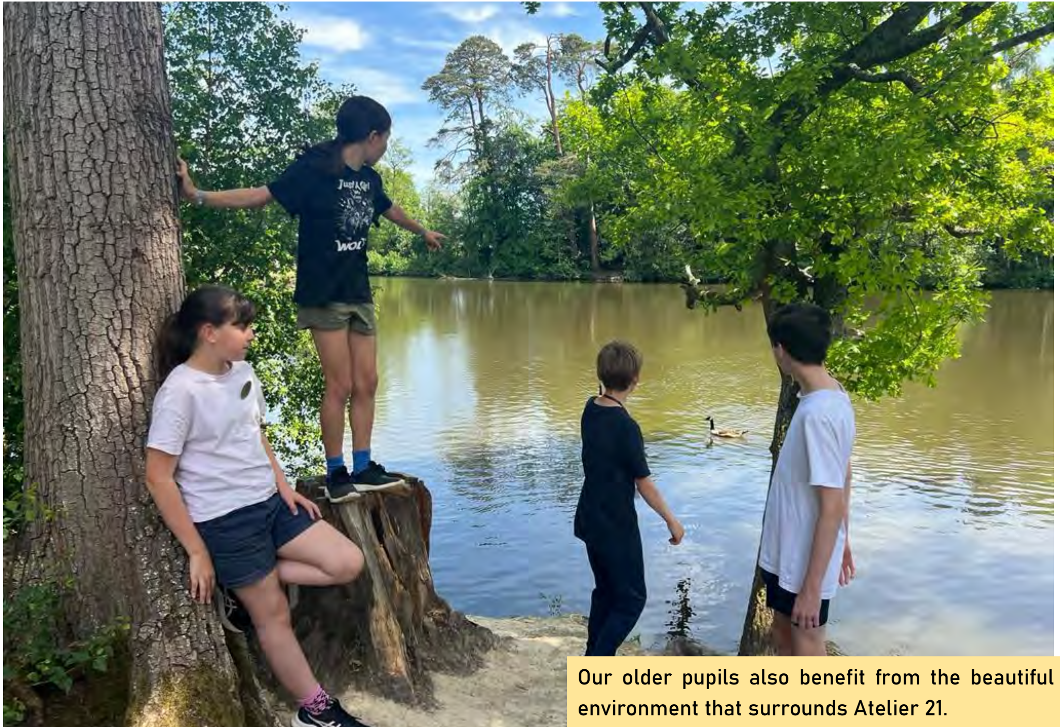
Our older pupils also benefit from the beautiful environment that surrounds Atelier 21.