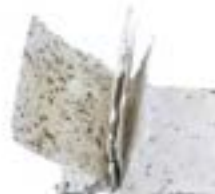
eco sketchbook by Indy