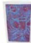
eco Christmas card by Florence