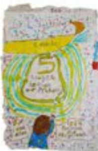
eco comic by Noah