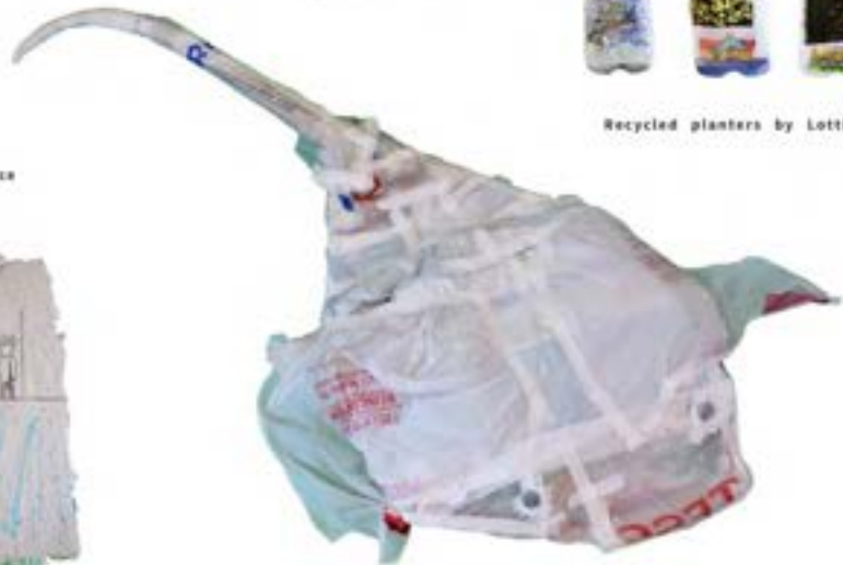
Recycled stingray by Archie