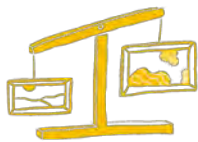
Decision Making Skills